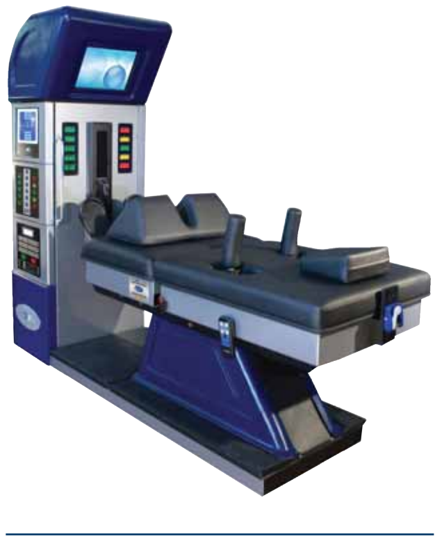
FIGURE 1. THE DRX9000™ NONSURGICAL SPINAL DECOMPRESSION DEVICE.

According to the most recent literature-supported recommendations released by the American College of Physicians and the American Pain Society, nonpharmacologic therapies for chronic LBP include acupuncture, exercise therapy, massage therapy, Viniyoga-style yoga, CBT or progressive relaxation, spinal manipulation, and intensive interdisciplinary rehabilitation.<sup>3,27,28</sup> Other treatments include back school, interferential therapy, low-level laser therapy, lumbar supports, short-wave diathermy, TENS, ultrasonography, acupressure, neuroreflexotherapy, spa therapy, and simple motorized and computer-controlled traction.<sup>3,22</sup>